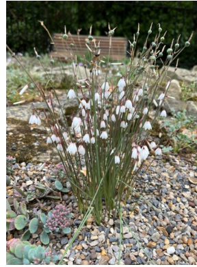
Cassiope Selaginoides, heather stock, rockery St Mary's Church garden.