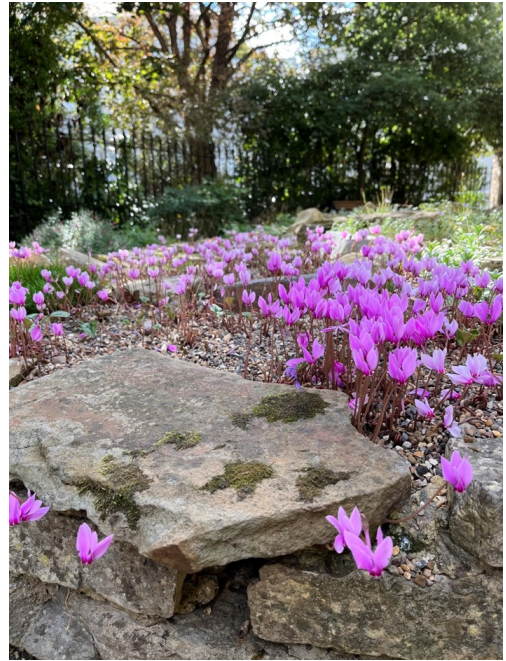
Cyclamem, St Mary's Garden