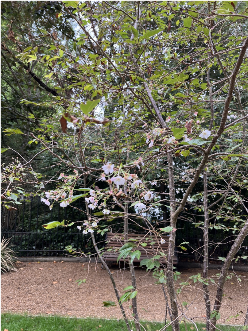
Winter flowering cherry tree, prunus serruleta St Mary's Garden