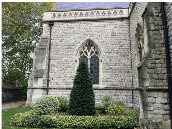
Image: St Mary The Boltons memorial garden