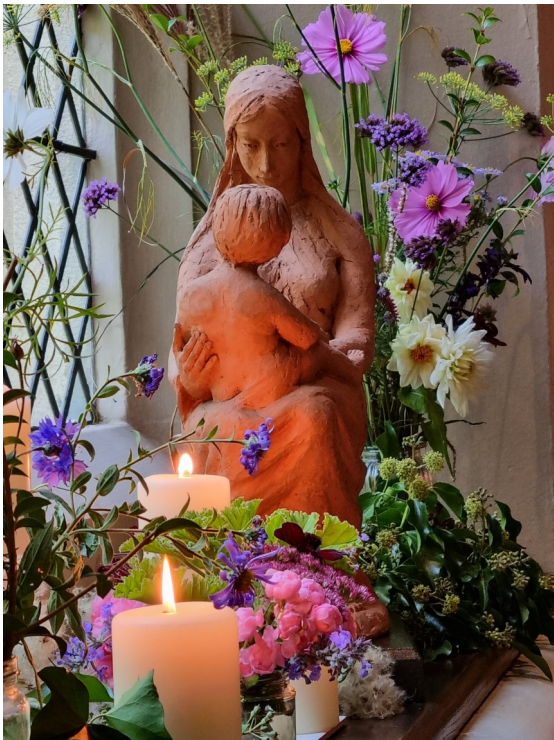
Image: St Mary's Madonna & Child, with flowers for a wedding in October. D. Ireton

A group of people gather to sit together in silence for some 40 minutes. No spoken prayers are said, just the tinkle of a bell at the beginning, end, and half-way through. Being silent for a little while is an invitation to listen to what is happening inside. In our liturgies we are used to address God in praise and song, but listening to the inner 'still small voice' may take some more attention. Doing it with other people forms a creative power that can be felt and can be powerful. Letting go of the need to be busy even for a little time is not only relaxing, but will eventually lead us to the truth of our selves that seems to be the big task of all our lives. There is no need to join anything, book or apologise; just come if and when you can.