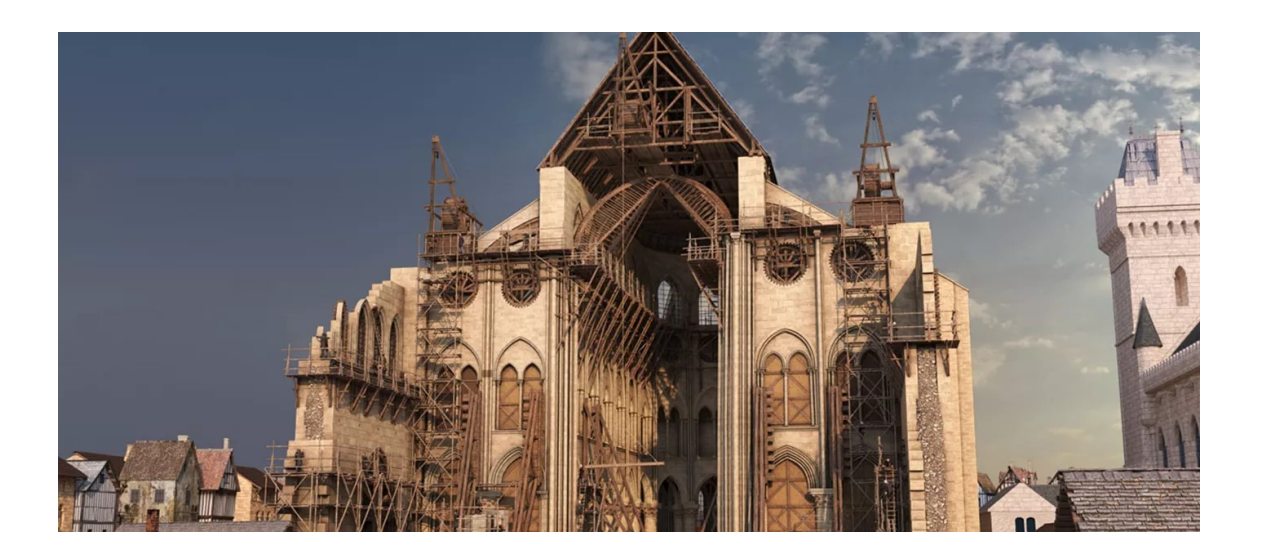
Image and text adapted from: www.westminsterabbey.org /abbey-events/special-tours-and-events/2024/ february/notre-dame-de-paris-the-augmented-exhibition-

Parish Pass: We have a Parish Pass giving free entrance to the Abbey for up to four people per visit, which can be borrowed on request from the office. We also have four free passes to St Paul's Cathedral, which includes access to the long climb up to the Golden Gallery at the very top of the dome. Ask in the office if you would like to borrow them.