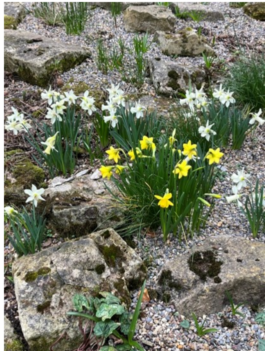
Daffodils in the rockery, St Mary's Church garden