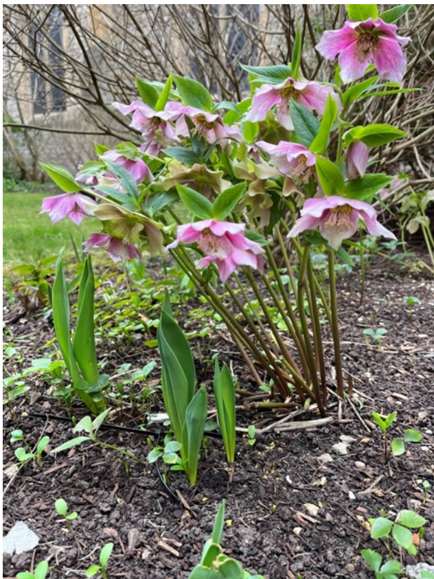
Hellebores, St Mary's Garden

A group of people gather to sit together in silence for some 40 minutes. No spoken prayers are said, just the tinkle of a bell at the beginning, end, and half-way through. Being silent for a little while is an invitation to listen to what is happening inside. In our liturgies we are used to address God in praise and song, but listening to the inner 'still small voice' may take some more attention. Doing it with other people forms a creative power that can be felt and can be powerful. Letting go of the need to be busy even for a little time is not only relaxing, but will eventually lead us to the truth of our selves that seems to be the big task of all our lives. There is no need to join anything, book or apologise; just come if and when you can.